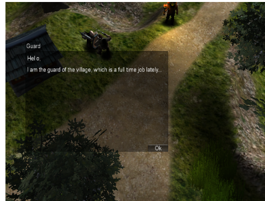
Fig. 1. Screenshot from the RPG implementation

Classical RPGs involve a storyline with quests in which the player character can interact with various friendly characters but also fight or compete against enemies. RPGs have the potential for an infinite variety of stories and situations, including NPC character