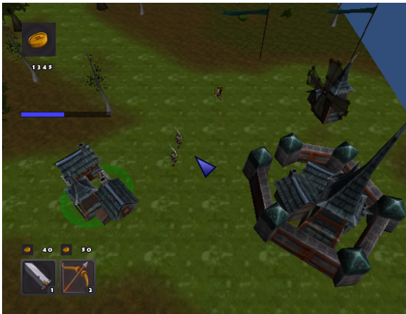
Fig. 2. Screenshot from the RTS implementation

gratitude from Alice, without having to script all these possibilities explicitly.